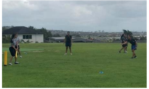
Coaching at Nga Iwi and Mission Heights

During the season, the Club forged a relationship with Counties Manukau Kirikiti Association as a means of tapping into that sporting community. The Club provided with coaching in local schools and assisted with local tournaments where able. The closeness of the two formats was highlighted when the Papatoetoe Premier Women's team entered in and won a Kilikiti tournament in January.