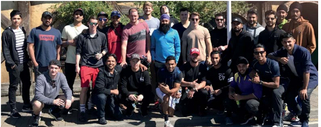
Premier Men and Reserves Pre-Season in Tauranga