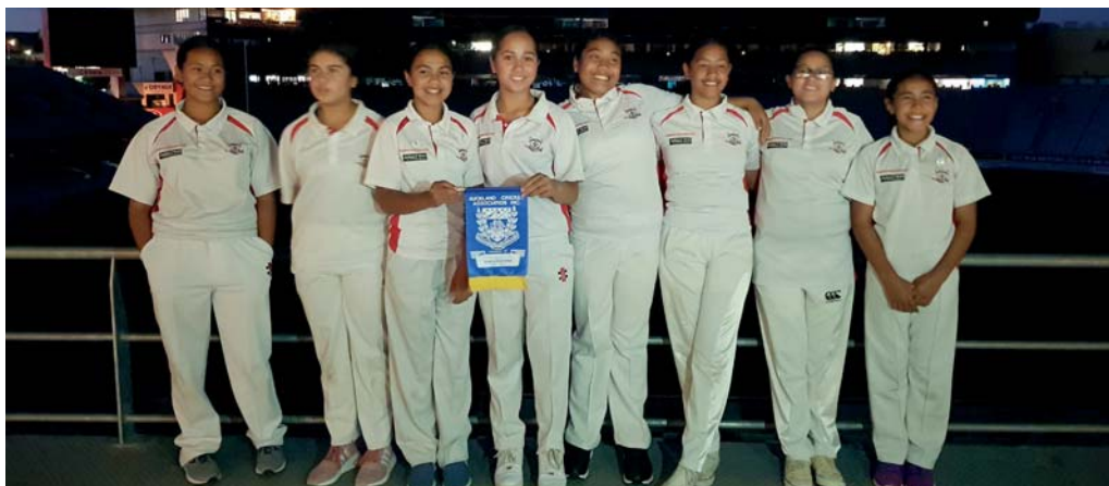
U15 Girls at ACA Prizegiving after receiving their Winners Pennant