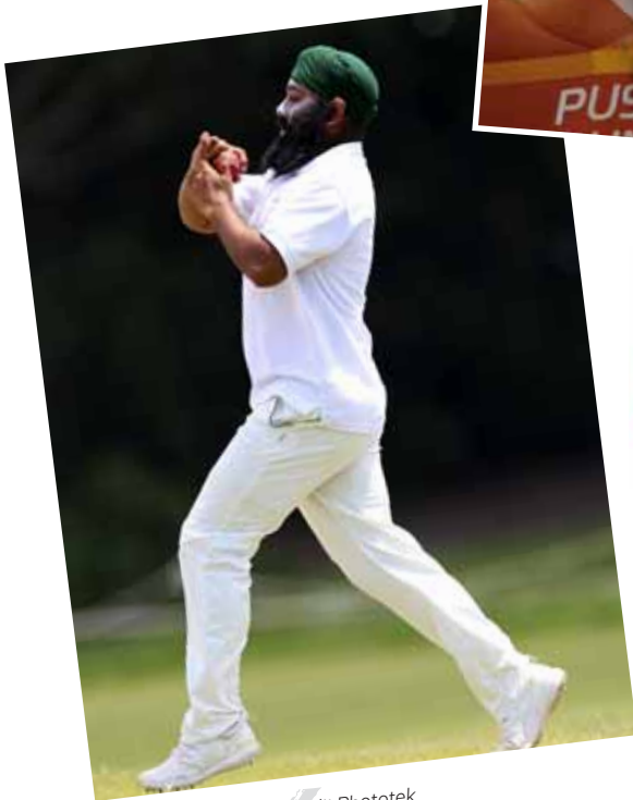
Bhupinder Singh