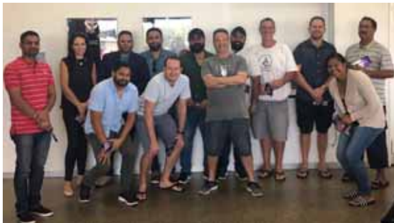
Junior & Youth Squads Managers and Coaches